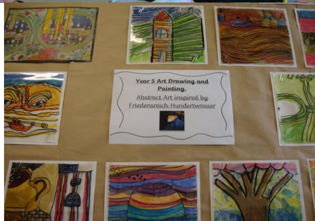
Superb art work Year 5; well done!